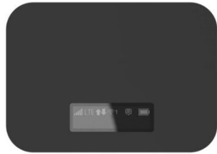
FRANKLIN T10 HOTSPOT MOBILE HOTSPOT