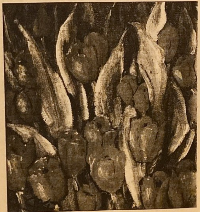
Dolores Sekel's work, "Tulips," is an intense oil painting filled with brilliant radiance in a pool of broad green leaves.